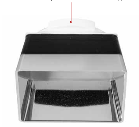
The high quality external reflector with Darklight technology provides high visual comfort and minimises glare. This makes the downlights also suitable for office applications.