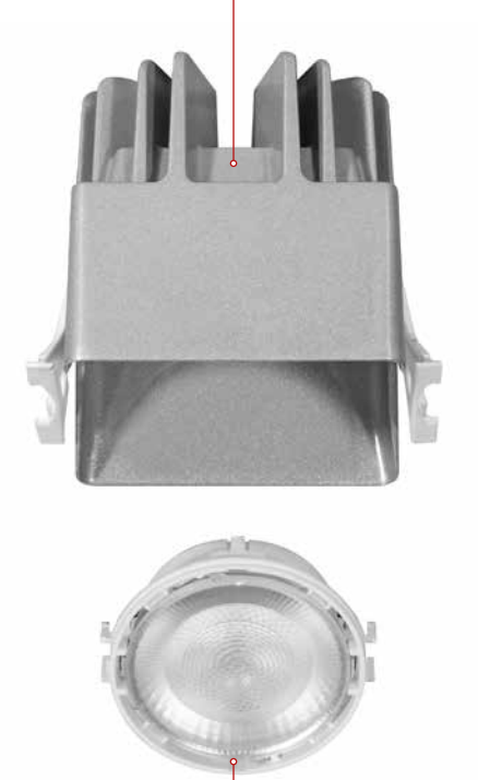
The Optical Core System consists of an LED module, inner reflector and lens.

The mounting ring and housing are fixed in the ceiling with a clip system, as standard with Lunis® downlights.